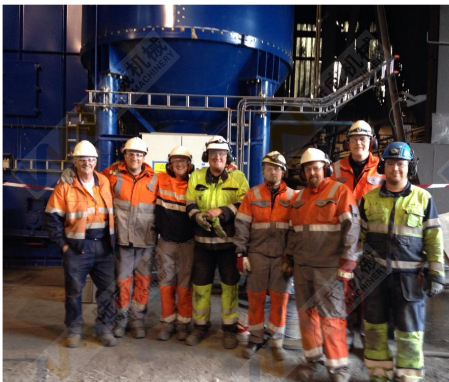
11.Kazakhstan 300T bolted cement silo in 2015