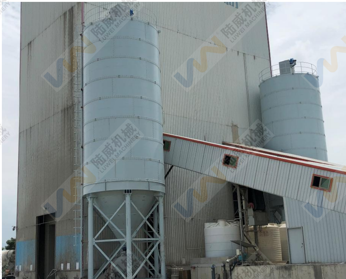
31. 4 sets 1000T bolted silos and 500T bolted silo in Oman in 2019