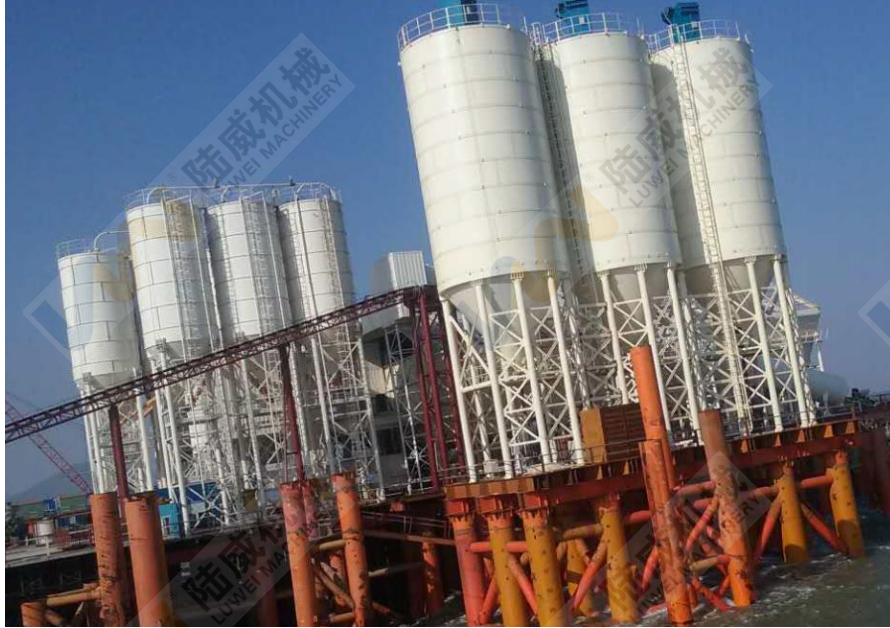
14. Philippine 150T bolted cement silo for batching plant in 2015~2018