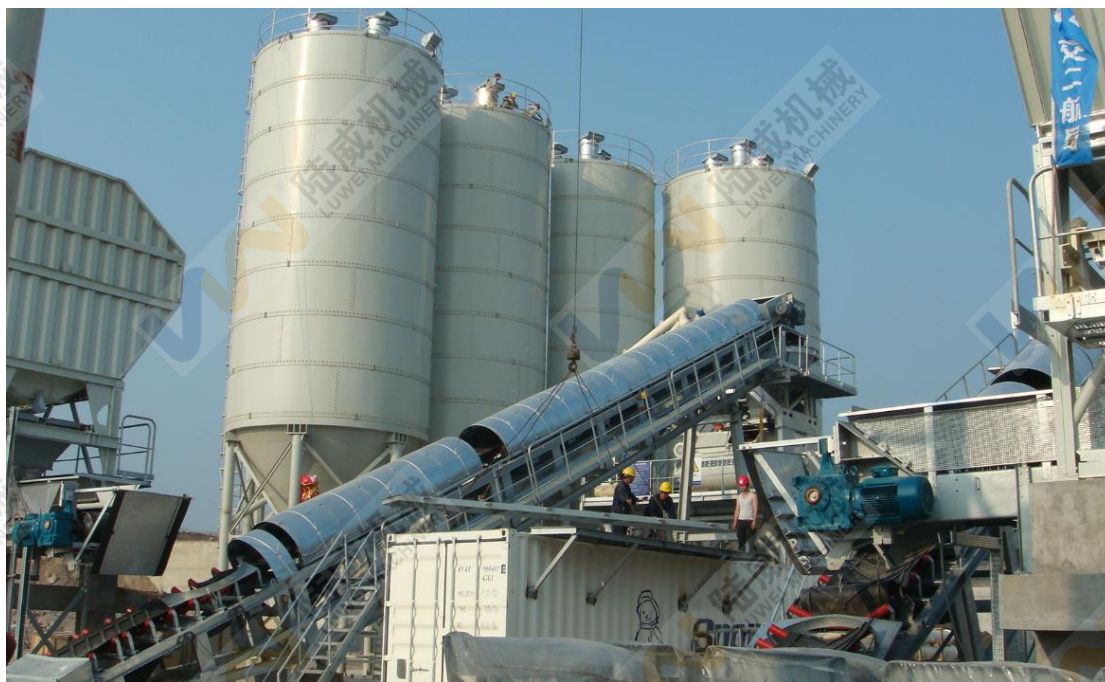
2. Cambodia 3 units of 500T bolted silo in 2012